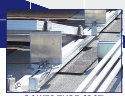
POWER TUBE CRS™